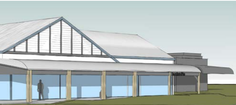
Concept design for the planned Rosewood library