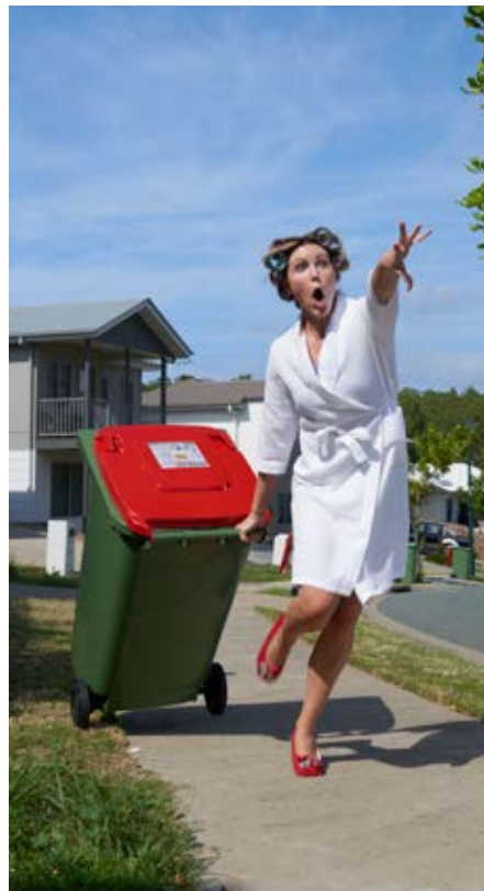
Don't get caught out with changes to bin collection days from September

All affected households will be notified of the changes in writing and will receive a calendar highlighting their new collection days.