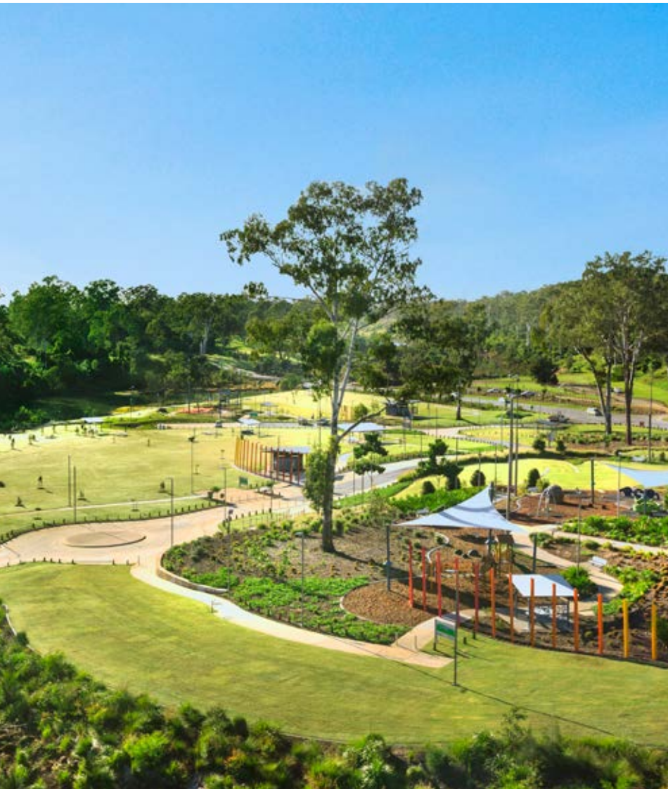
Colleges Crossing Recreation Reserve at Chuwar is set for upgraded parking and pathways

Council's Sealed Road Rehabilitation Sub-Program will improve conditions along sections of Blackall, Bass, Elizabeth, Delacy, Hood, Perth, Burke and Hopetown streets, Fullelove, Tasman and Wentworth courts, First and Fifth avenues, Phillip Crescent and Blackwall Road during this financial year.