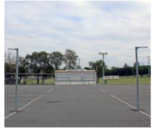
Lighting will be upgraded at the netball courts at Evan Marginson Park, Goodna

Council will replace existing netball court lighting with LED lighting. LED lighting is brighter and more energy efficient, benefiting both players and the environment.