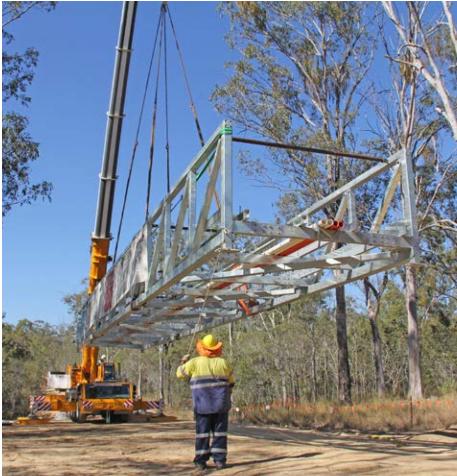
One of three 25m steel truss bridges is manoeuvred into place as part of stage four of the Brassall Bikeway

Important work to address Ipswich's current and future transport needs is continuing. In June this year council endorsed the final version of its City of Ipswich Transport Plan, iGO. It will help guide council in its funding and planning decisions and will be a valuable tool for lobbying other levels of government for support. To learn more about iGO visit ipswich.qld.gov.au