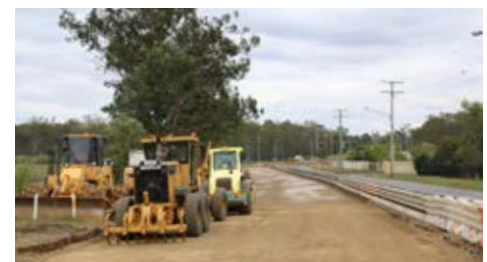
A section of Toongarra Road referred to as the 'missing link' has been upgraded

As well as the reconstruction of the road pavement, the works carried out by council included installation of kerb and channel and underground drainage.