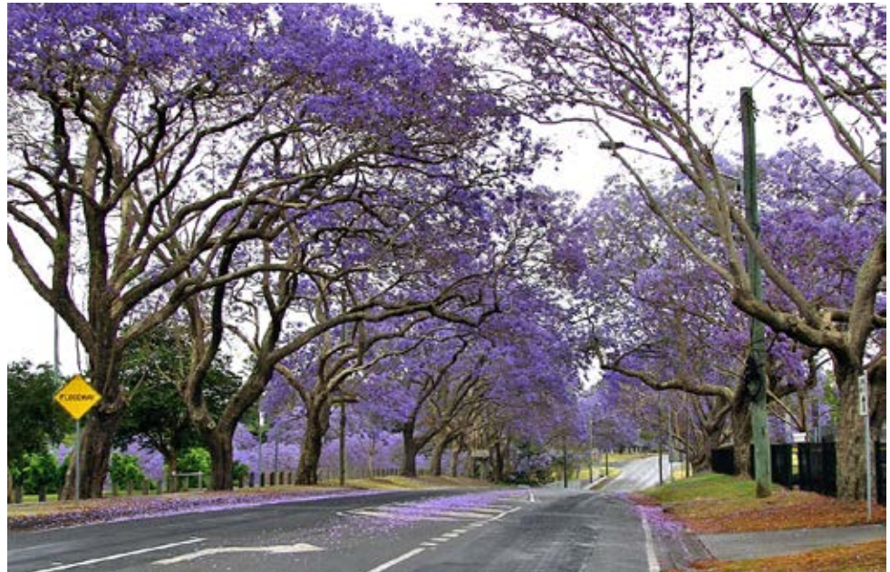
Goodna's Jacaranda trees will once again be on show in October

Council has also set aside money to replace the softfall at the park's playground.