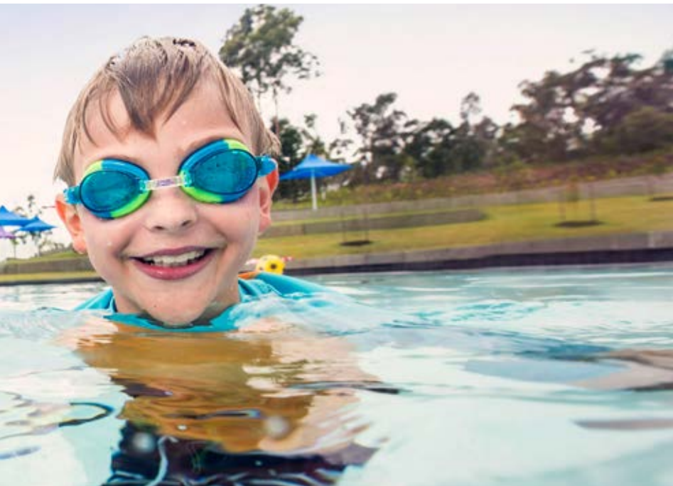
Orion Lagoon received regional design and leisure awards in June