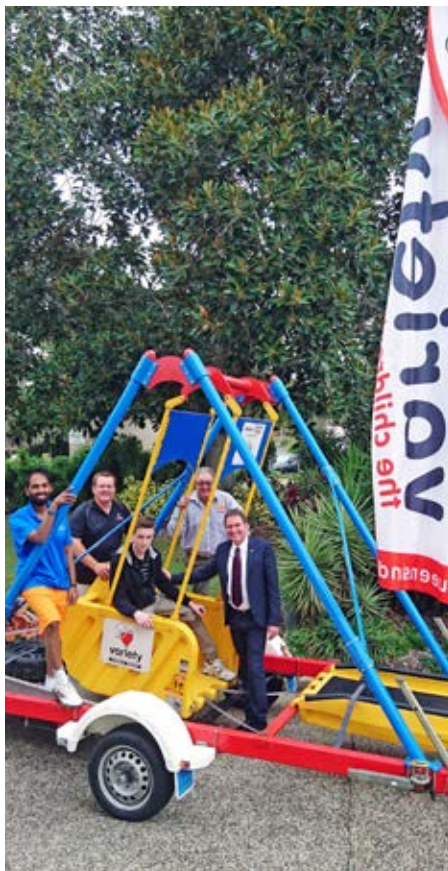
Members of the Springfield community deliver a Liberty Swing for Robelle Domain

Variety has helped to provide the swings at more than 185 communities across Australia.