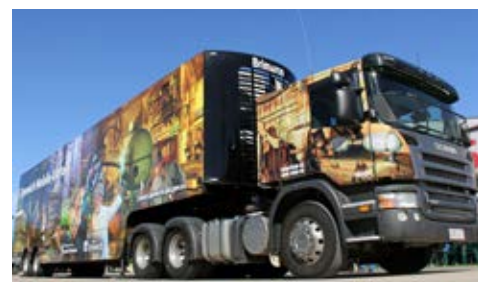
Ipswich's new Mobile Library was officially rolled out in late July

For the full schedule of Mobile Library stops visit Library.ipswich.qld.gov.au