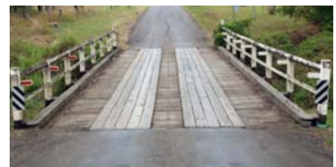
The Halletts Road bridge will be replaced with a new two-lane concrete structure

Construction is expected to begin in the last quarter of this year, with the new bridge due to open in the first half of 2017.