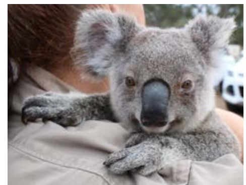
Koalas like Phil will benefit from the historic Koala Conservation Agreement

Property owners with land that has been identified as having koala habitat present and property owners with the potential to