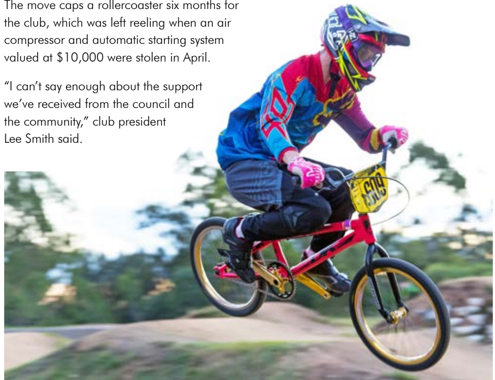
Members of the Ipswich BMX Club will benefit from infrastructure upgrades.

Work on the new ramp, canteen and announcer's box is set to start in the first quarter of next year.