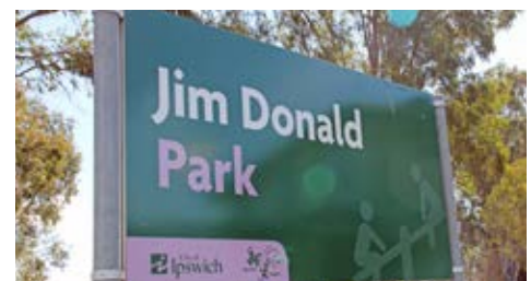
Jim Donald Park will form an important part of the 16-hectare Jim Donald Parklands

The 16-hectare parklands are bordered by Blackstone Road to the north; Cambridge, Russell and Madden streets to the east; Robertson Road to the south; and Cooina Street and Grange Road to the west.