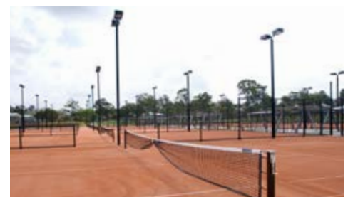
The George Alder Tennis Centre at Leichhardt is set for an upgrade

Hot Shots is designed for children from as young as three. It features four stages of development, with participants eventually working their way up to play on full-size courts.