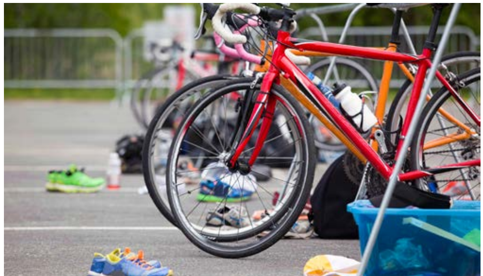
A criterium facility at Briggs Road will provide new opportunities for Ipswich

It will become Ipswich's leading cycling venue, replacing the Limestone Park velodrome that was demolished in 2010.