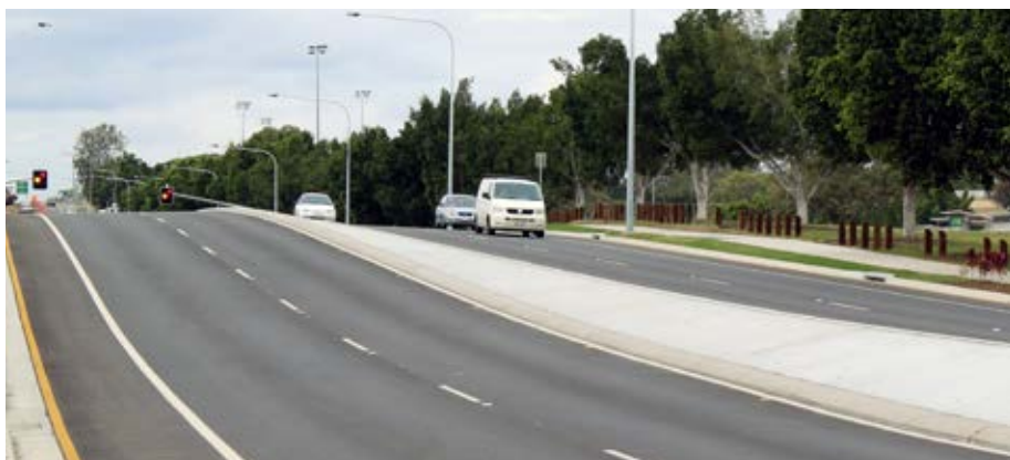
The $9.3 million stage one upgrade of Redbank Plains Road opened in April

About 20,000 vehicles a day use the road, with a predicted increase to 27,000 vehicles a day by 2025.