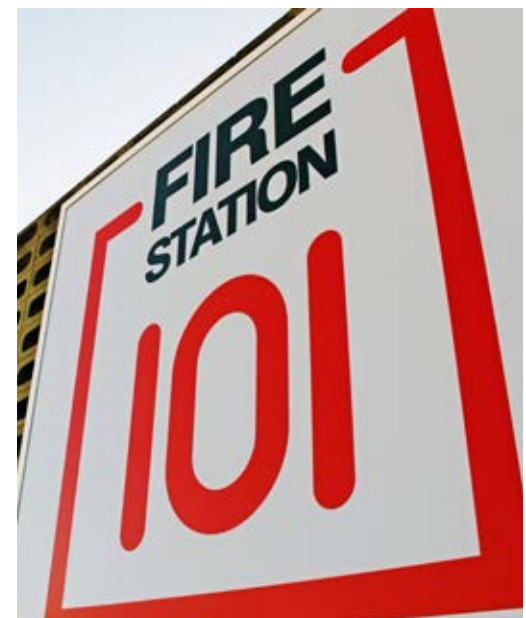
Fire Station 101 is Ipswich's digital hub and startup incubator

Council is also continuing to progress its CBD revitalisation, earlier this year unveiling plans for a $150 million redevelopment of Ipswich City Square that will include a multi-use precinct with a new council administration centre, retail stores and cafes.