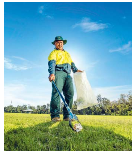
Council staff maintain more than 550 parks in Ipswich

Their work is to be congratulated, as is the patience of residents as council continues to manage the fast growing grass in our parks and along our footpaths.