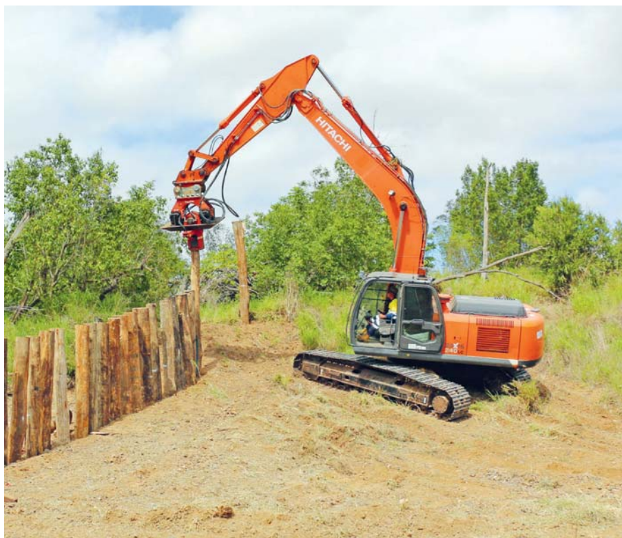
Work on the Sapling Pocket project started in January