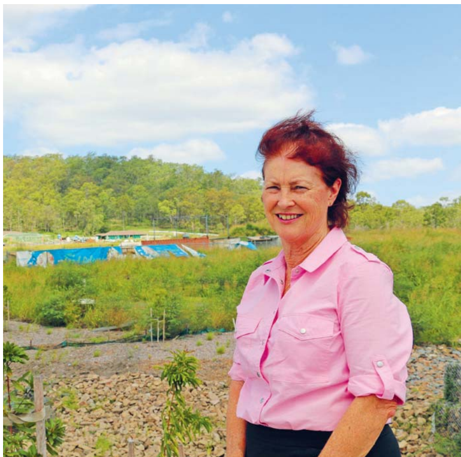
Land set aside for the community centre is currently being used by developers