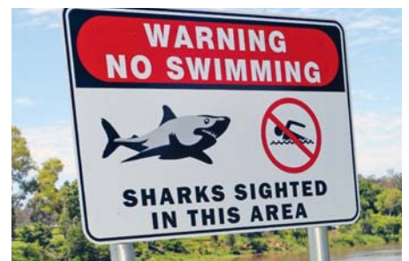
The new sign at the Goodna boat ramp

The sharks are most active around dawn and dusk.