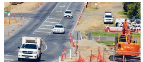
Stage two work at Redbank Plains will cost $7.6 million

It offers access to the Ipswich Motorway and Centenary Highway as well as major residential, business and industrial developments.