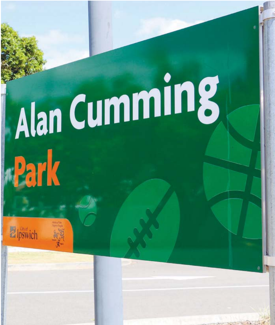
Alan Cumming Park will benefit from the installation of new lights