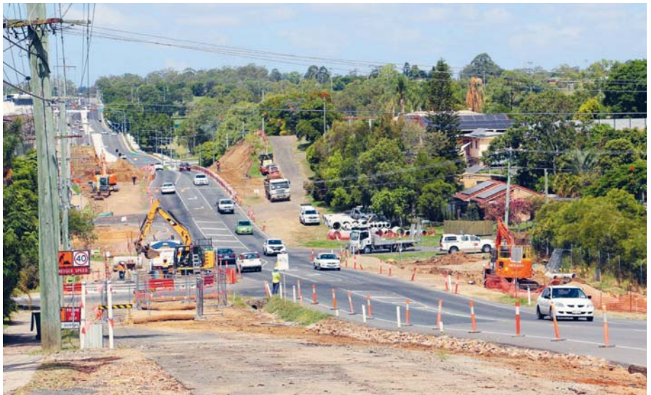
The next stage of the Redbank Plains Road upgrade has started

It offers access to the Ipswich Motorway and Centenary Highway as well as major residential, business and industrial developments.