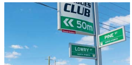
The intersection of Pine and Lowry streets at North Ipswich

Motorists should expect delays while the works take place.