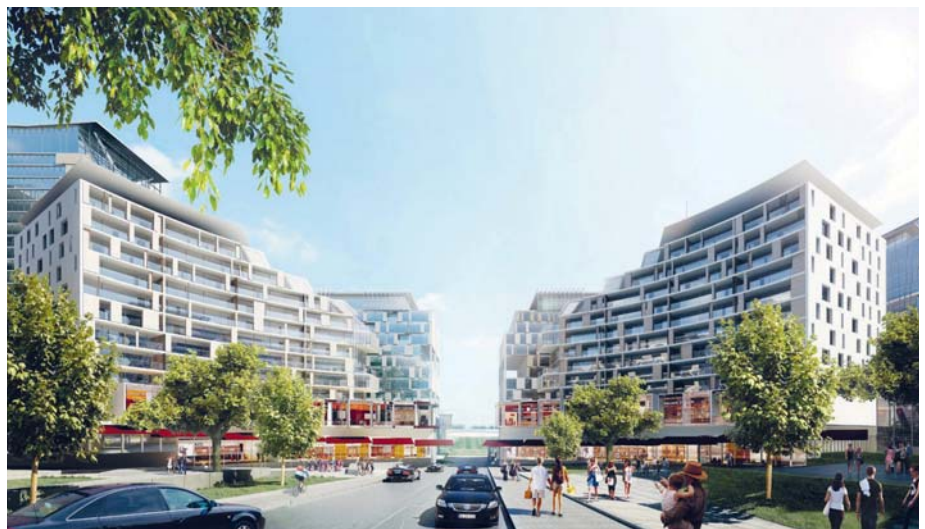
An artist's impression of the Central Gardens development