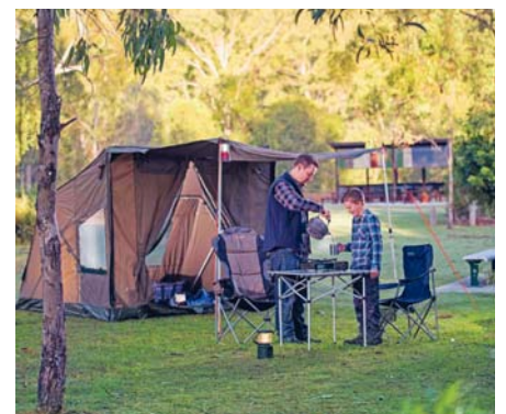
Hardings Paddock is a popular destination for campers

Facilities include toilets, camp-shower cubicles, kitchens, barbecues, tables, a holding yard for horses and caravan access.