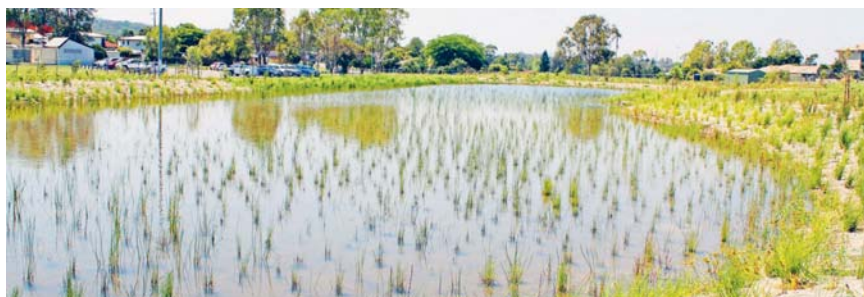
Part of the wetland system at Jim Donald Parklands

The project will be funded through council's Stormwater Quality Offsets Program, improving wildlife habitat and the quality of water run-off into Deebing Creek while reactivating the land for community use.