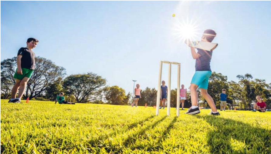
Council is committed to securing the green future of Ipswich for future generations to enjoy