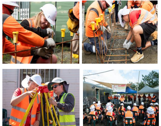
Hymba Yumba students on Try a Trade Day

BMD briefed the students in site safety and took them on a site tour and they gained intimate knowledge from our experts about road construction and how GPS and drone technologies are implemented on site. They also got them using their hands to weld pipes using electrofusion and set up formwork and steel fixings for concreting works.