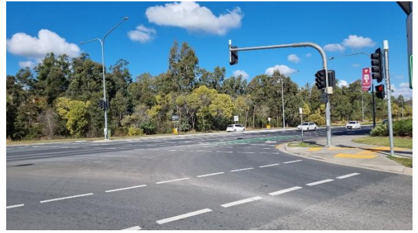
Eden Station Drive intersection, Springfield Greenbank Arterial

Stage 3 of the Springfield Parkway and Springfield Greenbank Arterial duplication has involved more than 10,000 tonnes of asphalt and 34,000 cubic metres of excavation so far.