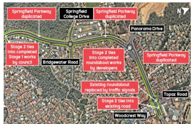
Stage 2 | Springfield Parkway Design

relocations and upgrades, including sewer and watermain, to mitigate disruption and maintain the project timeframe.