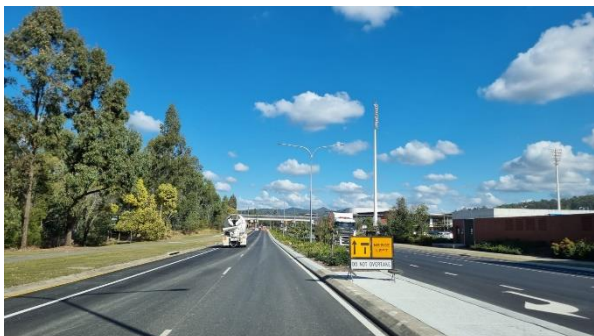
Springfield Greenbank Arterial southbound

A major construction milestone was reached this week, with four lanes opening along Springfield Greenbank Arterial, from the Eden Station Drive intersection to the rail overpass in front of Brighton Homes Arena.