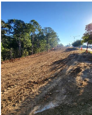
Stage 2 | Corridor clearing

Stage 2 early works have focused on the construction and upgrade of drainage culverts and vegetation clearing along the corridor in preparation for the duplication of Springfield Parkway. The clearing occurring on council land will be completed in July.