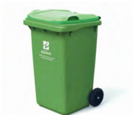
240 Litre Garden Organics Bin

To commence a GO Bin service please visit ipswich.qld.gov.au/organics