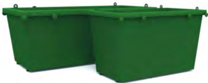
3m 3 Skip