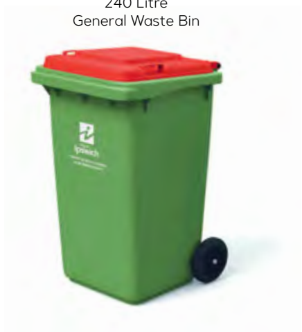
240 Litre General Waste Bin

This service is not suitable for recyclables or garden waste. Recyclable items should be placed into the yellow recycling bin and garden organics into the green GO bin.