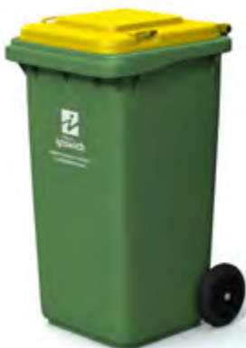
360 Litre Recycling Waste Bin